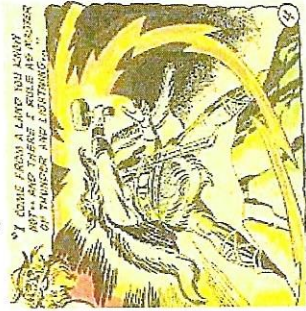
Thor, as depicted by Jack Kirby in Tales of the Unexpected #16 (1967).

Thor had a chariot to travel across the sky, which was drawn by two giant goats: Tanngrisnir and Tanngrisnir. These powerful animals had a very convenient magical property: they could be killed and eaten at any time, and as long as their bones were undamaged and returned into their skins, they would regenerate overnight and the following day would be alive, just like new.